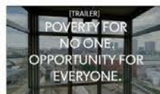
TRAILER for Short Documentary "Poverty for No One. Opportunity for Everyone." by Dan Collison