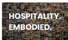
Documentary: DID Ambassadors | HOSPITALITY. EMBODIED