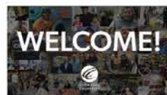
Welcome to Catholic Charities of Saint Paul and Minneapolis