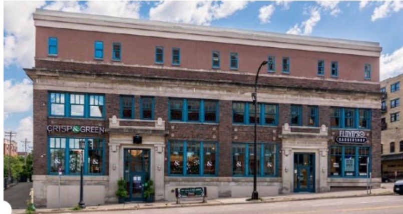
GreaterGood acquired an office building at 424 Washington Ave. N. in Minneapolis' North Loop neighborhood for an undisclosed amount.