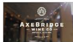
Axebriidge Wine Co Opening in the North Loop (TEASER)