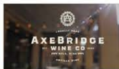
Axebriidge Wine Co Opening in the North Loop