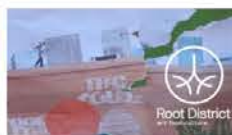
The North Loop Root District: art, food, culture