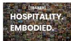
TRAILER: DID Ambassadors | Hospitality Embodied