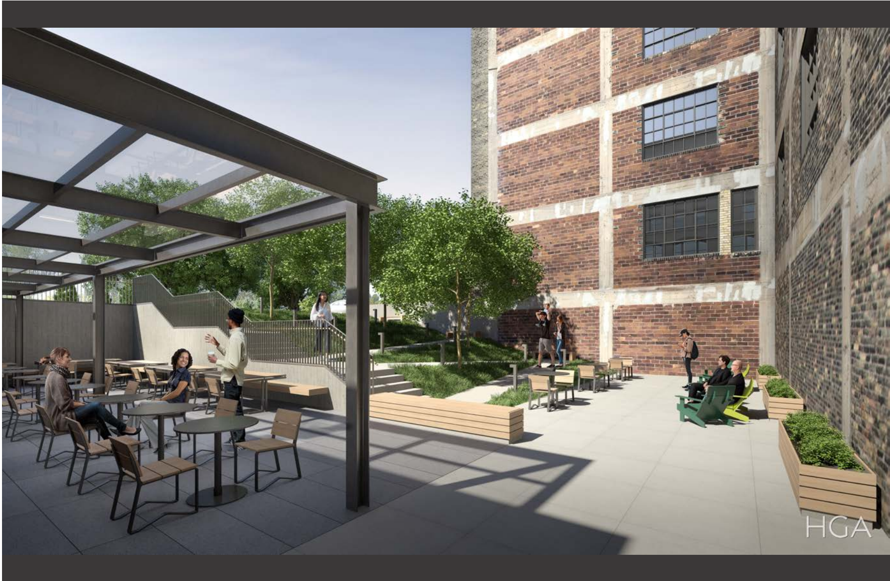
Rendering of proposed River Connection Park.