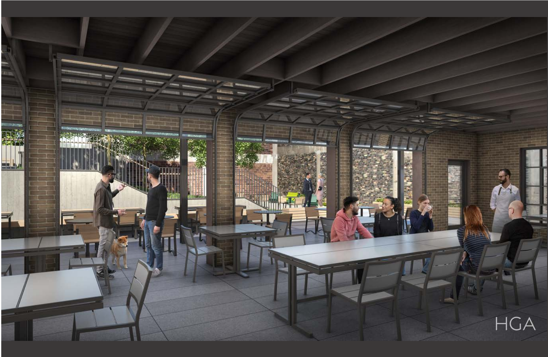
Interior view of proposed annex improvements and park.