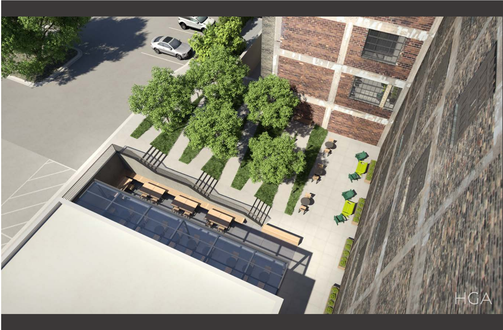
Aerial view of proposed River Connection Park.