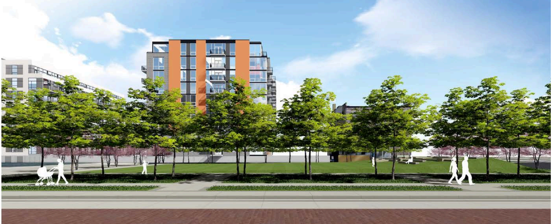
Potential North Loop Park